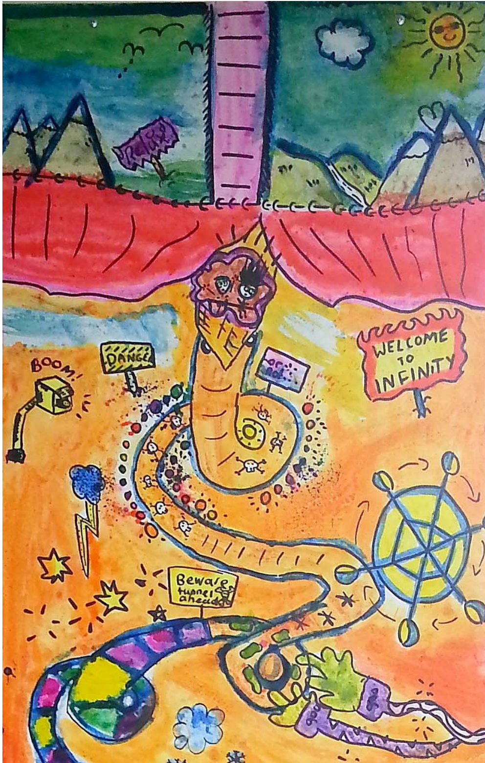
Figure 2: Detail from panel made by five children from Whitchurch Primary School, Cardiff, Wales (2013). Welcome to Infinity . Market pen and ink on Medium Density Fibre board (600mm x 400mm).