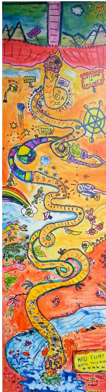
Figure 1: Made by five children from Whitchurch Primary School, Cardiff, Wales (2013).

This is the first step towards an ongoing research project which will draw out the significance of participatory and relational art for existing rationales for teaching art in primary schools art education in Great Britain. This is via a rigorous empiricism focused on what happens when collaborate children make imaginative art in primary school.