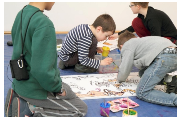
Figures 3-8: Children working on collaborative imaginative drawings. For a complete hi-resolution photo-story of this workshop visit Ficker .