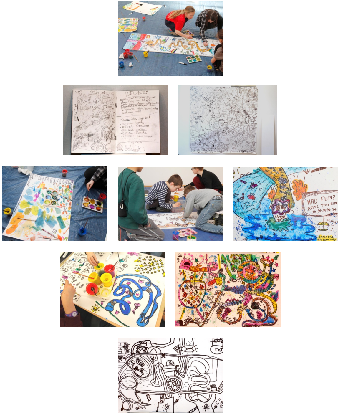
Fig. 14, Photo elicitation diamond – children’s group choices