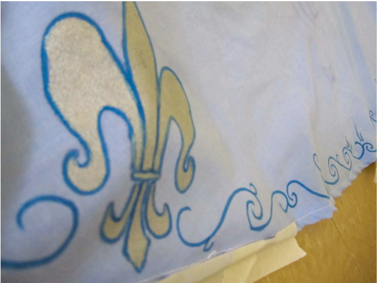
Figure 3: Christine (2012) Fleur de lis . Painting – acrylic & dye on fabric.

Key to the development of the group was the informal time we took to respond and celebrate the work of each participant, offering suggestions and our praise for the uniqueness of each creation. Students found that watching others work, and observing their progress was inspiring and motivating. Following the suggestion of the participants, I began serving tea mid-session, in an effort to create a stronger bond and community in the classroom. Students felt that this gesture created an opportunity to take a step back, and explore their work from a far, as well as take a moment to view what the other participants had been working on.