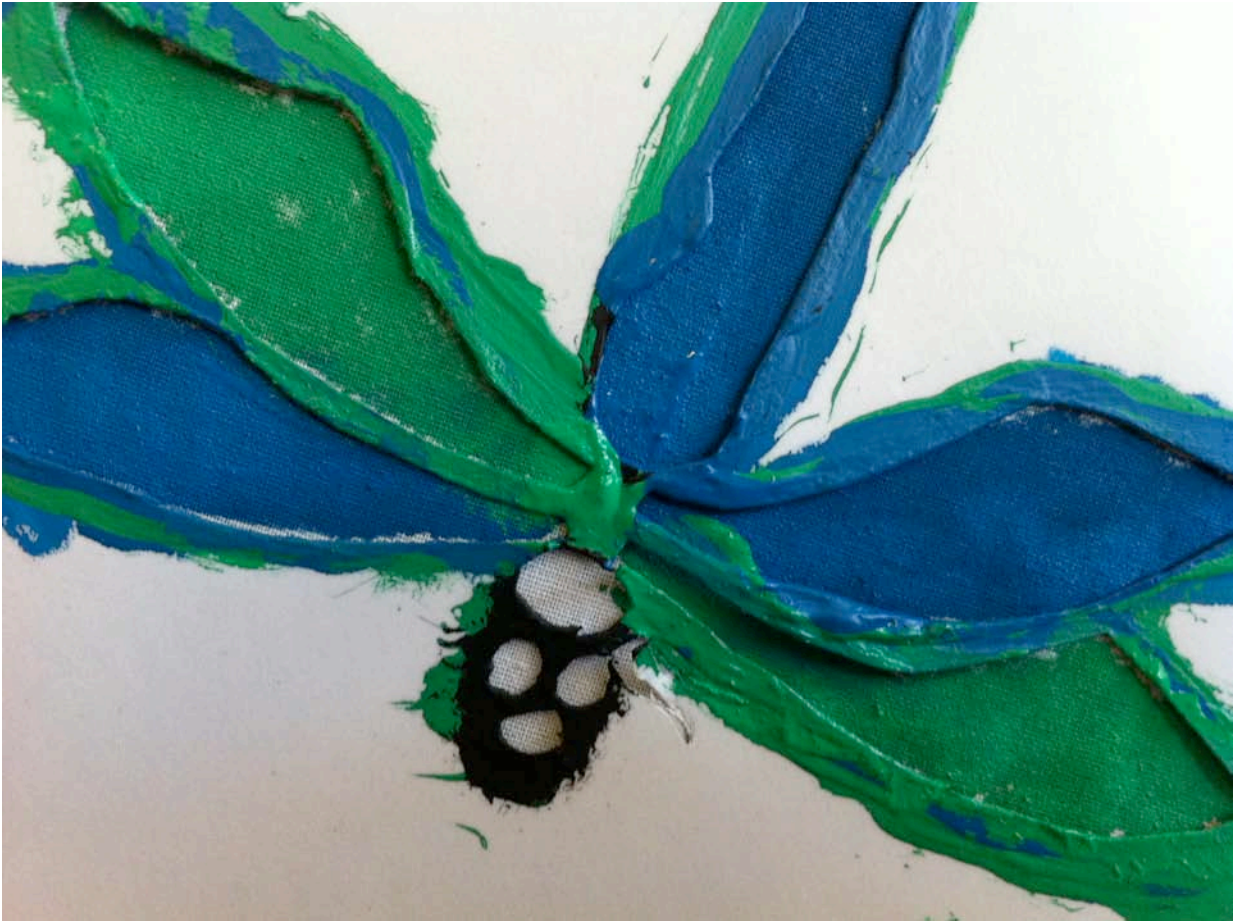
Figure 2: Sandra (2012) Dragonfly . Stencil – acrylic on fabric.

To insure the reliability and validity of the findings of this study, several means of data collection were used, including audio recorded focus groups, observational field notes and journal entries (taken both by me and my students), and photographs taken of the art works produced during the study and our process. To initiate the study, current students and interested residents were invited to join the studio art class through the means of a flyer posted in the entranceway. They chose to create fibers-based works, specifically tablecloths, with the intention of personalizing their individual apartments.